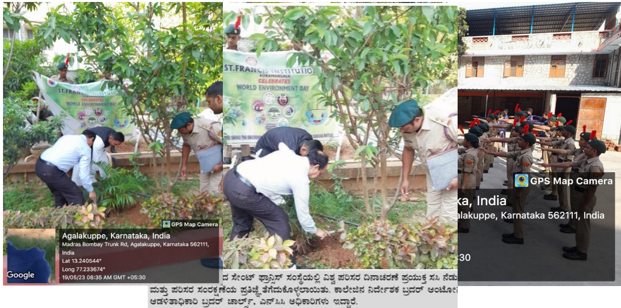
Event published in Sanje Vani News Paper on 19/05/2023